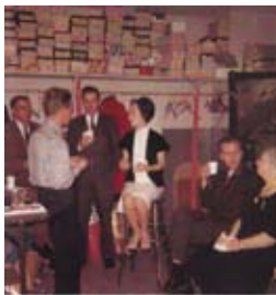
At work on The Perry Como Show