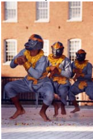
The Angkor Dance Troup in Monkey Dance

Three Cambodian-American teenagers come of age in a world shadowed by their parents' nightmares of the Khmer Rouge. Traditional Cambodian dance links them to their parents' culture, but fast cars, hip consumerism, and new romance pull harder. Gradually coming to appreciate their parents' sacrifices, the three teens find a balance between their parents' dreams and their own.