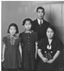
Family portrait, 1938