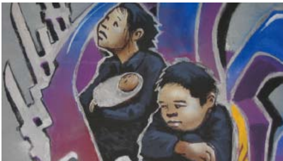
Mural from Underpass

1992, San Diego. A family that survived the Cambodian Khmer Rouge has rebuilt their lives over the past 15 years, operating a donut shop and establishing themselves in the community.