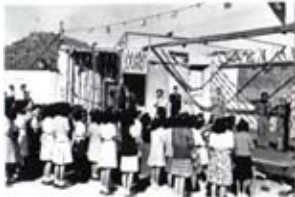
Gila River Camp assembly