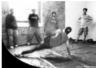
Angkor Dance Troupe members breakdancing