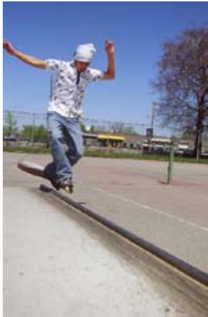
Sochenda Uch